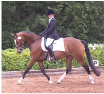
Absolut "Abby" and myself competing at Amherst July 2-4, 2004